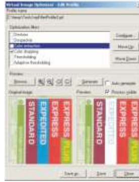
VIP filter profile configuration dialog