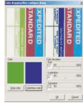
Color dropping configuration dialog